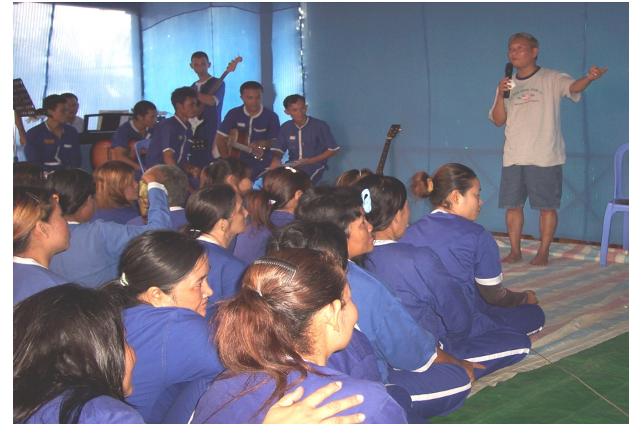
“to hear a prisoner's groaning, to set free those condemned to die,” Psalm 102:19-21 Mission Cambodia (ministering to prisoners)